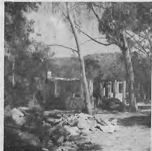
Below: The monastery of the Minim brothers being constructed in 1972